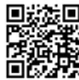
Pieces of My Heart